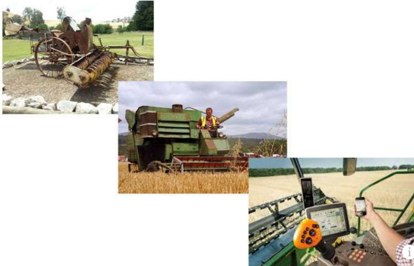
Exhibit 3: Industrialization in Agriculture

Technology is the container for this information and its transfer, and it is developed to support and supplement industrialization through the following five steps: